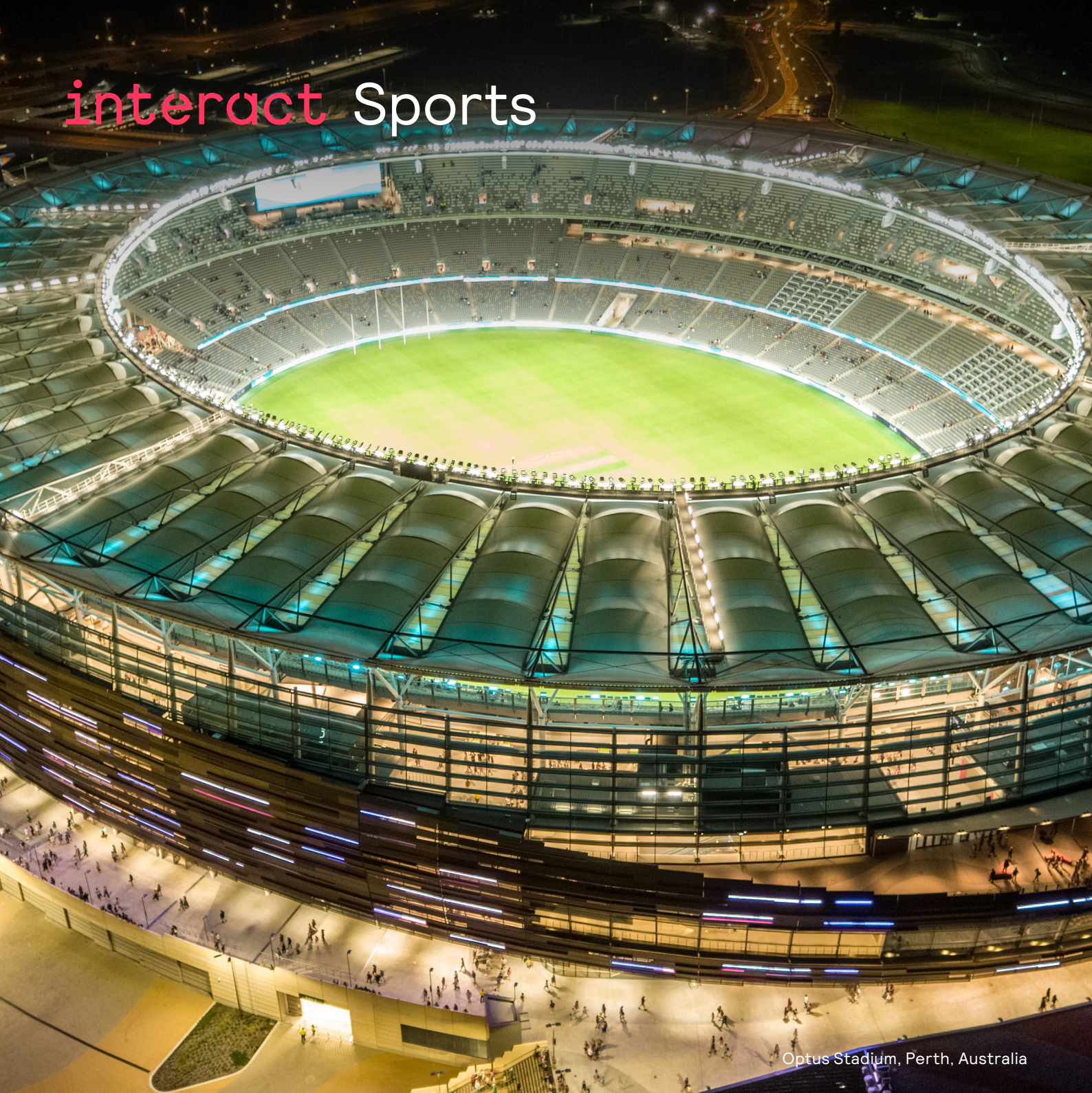
Optus Stadium, Perth, Australia